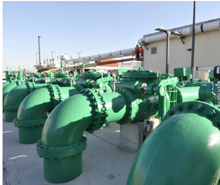
Fig 4 -- New influent pumping station installed at the Largo WWTP, along with a 5 million gallon equalization tank, is capable of holding the storm surge flows experienced during hurricanes and other extreme weather events.

One of the other major goals of the city's $60 million investment in its 18 million gallon per day (mgd) WWTP was to rehabilitate and harden many of its critical structures to improve and extend the life of the plant for many more decades (fig 4). As with most WWTPs, most of the important structures were built with cast-in-place concrete.