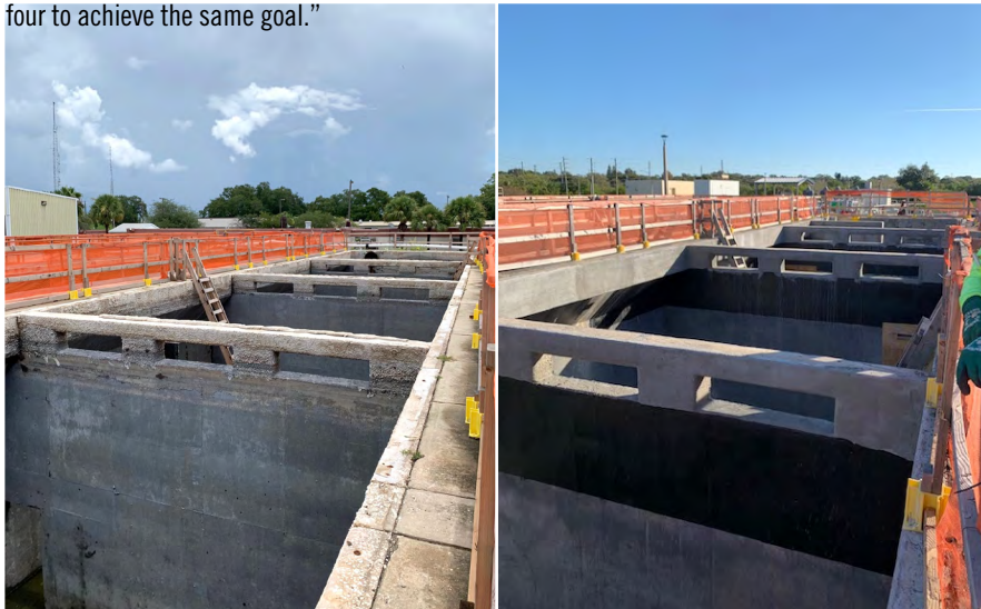
Fig 7 -- LEFT: Here, one of the 25 ft x 100 ft multi-compartment BNR channels is undergoing rehabilitation using Xypex Megamix II with Bio-San repair mortar to rebuild severely deteriorated concrete. RIGHT: shows BNR channel after restoration with Xypex Megamix II with Bio-San. Black strip is a layer of coal tar epoxy applied as added protection in H 2 S gas hot zone.

Xypex Megamix II with Bio-San is a resurfacing mortar that combines Xypex crystalline waterproofing technology with a mineral-based antimicrobial that kills the Thiobacillus group of bacteria species responsible for microbial induced corrosion (MIC). Xypex also offers Bio-San in an admixture—Xypex Bio-San C500 —that provides the same protection for precast and cast-in-place concrete structures.