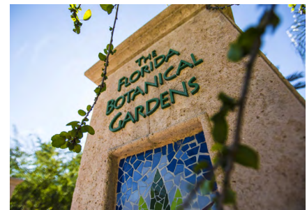
Fig 3 -- Largo, Florida, is a major tourist destination featuring white sand beaches, golf courses, shopping, and natural attractions such as the 100-acre Florida Botanical Gardens.

Too much of these naturally occurring nutrients can cause algal blooms that block sunlight thereby killing plants and reducing the water's oxygen content, ultimately killing fish and other aquatic organisms. Known as eutrophication, this process can damage drinking water resources, decimate recreation and aesthetic value, and cause taste and odor problems.