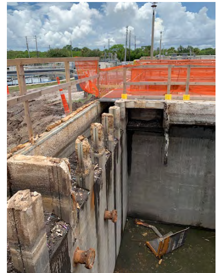
Fig 6 -- Xypex Megamix II with Bio-San repair mortar and Xypex Concentrate crystalline concrete waterproofing and repair treatment were used to restore many years of concrete deterioration at the Largo Wastewater Treatment Plant. Megamix saved time by allowing the repair and long-term protection of damaged concrete in one step.