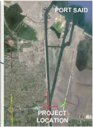
Location of new highway tunnels under the Suez Canal, just south of Port Said, the canal's northern most access point. The tunnels join the Sinai Peninsula with the Egyptian homeland, just east of Cairo.