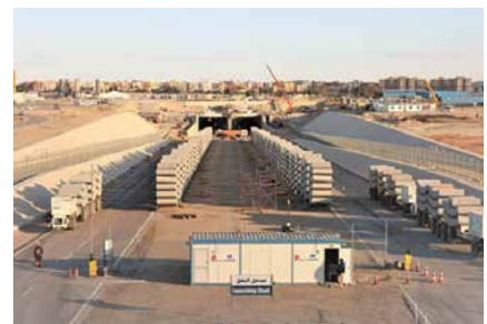
Hundreds of precast concrete tunnel lining segments are stockpiled at the entrance to the Ismailia highway tunnels. The two-lane roadways will carry up to 50,000 vehicles per day in each direction.

Four subcontractors, one each for the four highway tunnels, applied the Xypex Concentrate where needed. According to Amr Saad, approximately 95 percent or more of the seepage has been stopped using Xypex Concentrate.