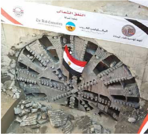
Four Herrenknecht Mixshield S-960 TBMs were used to simultaneously bore four two-lane highway tunnels under the Suez Canal in Egypt. Here, one of the TBMs emerges on the eastern shore of the canal south of Port Said, the northern most city along the canal.