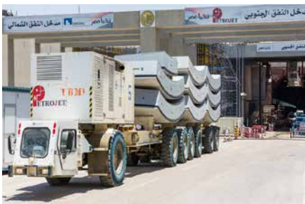
Nine precast concrete tunnel lining segments, required to create a single lining ring, await deployment into the tunnels.

“We provided a specification for the use of Xypex Concentrate to consultants ACE Moharram-Bakhoum,” notes Amr Saad, general manager for Beton, the Xypex distributor for Egypt. “We investigated several ways to apply the Xypex Concentrate to the joints to achieve optimal results. The Xypex crystalline waterproofing material needs time to diffuse into the concrete substrate. We modified our specification to recommend that the waterproofing contractors apply the Concentrate as a thick paste for best results.”