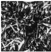
"An Enhancement in the Nature of Concrete with a Multiplicative Cement Crystal-Type Concrete Material", Central Research Laboratory of Nikki Shoji in association with Hosei University, Japan

A coating of Xypex Concentrate was applied to one face of a 300 mm x 300 mm x 220 mm set of concrete blocks; two replicate sets of blocks were left untreated. Water filled containers were tightly sealed onto the opposite face of the treated blocks and one set of the untreated blocks while the third untreated block set was kept in the laboratory as a control. Humidity probes were installed in 6 mm diameter holes that were drilled to within 30 - 40 mm of the water exposed surface. Mass humidity was recorded at intervals of 28, 45, 90, 125 and 132 days. Final results showed that the Xypex-treated specimens had an average humidity reading of 4.6%, the untreated sample measured 7.9% and the control block with no water exposure was 4.4%, essentially equivalent to the Xypex specimens' results. The Xypex reactive chemicals had diffused at least 190 mm in 132 days.